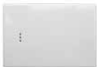
ELK-M1XRFTW Wireless Transceiver for ELK Two-Way Wireless Sensors