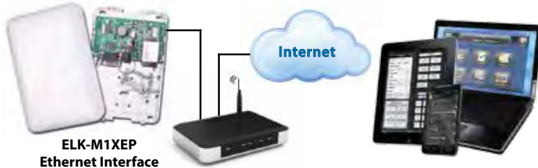
ELK-M1XEP Ethernet Interface